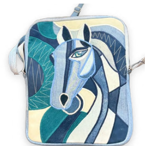
REINDIGO The Stallion Denim Sling Bag