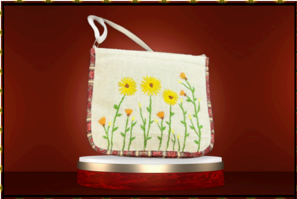
SUNBLOOM Multipurpose Jute Sling Bag