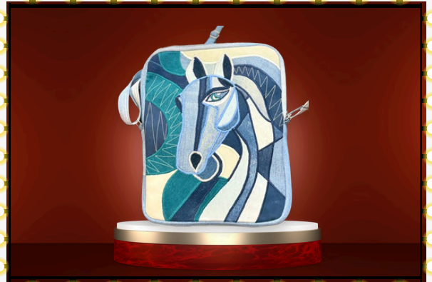
REINDIGO The Stallion Denim Sling Bag