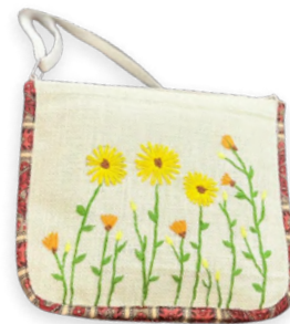
SUNBLOOM Multipurpose Jute Sling Bag